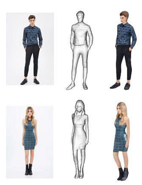
PIFu: Pixel-Aligned Implicit Function for High-Resolution Clothed Human Digitization [Saito et al. 2019]

Recently, implicit surfaces got more and more attention in the machine learning (ML) community to approximate 3D shapes. Stunning results have been achieved in morphing of 3D objects [Park et al. 2019] or reconstructing 3D models of humans from 2D images [Saito et al. 2019].